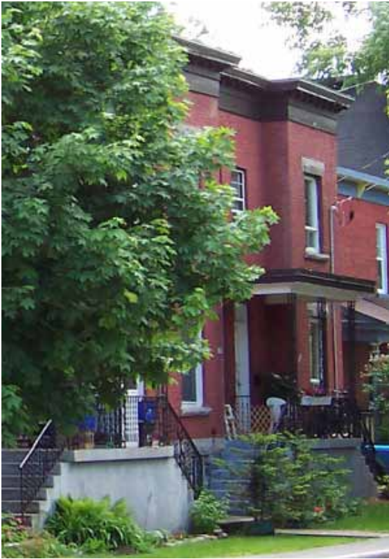
530 - 544 McLeod, CCOC's first homes.