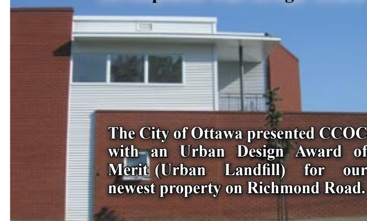
The City of Ottawa presented CCOC with an Urban Design Award of Merit (Urban Landfill) for our newest property on Richmond Road.